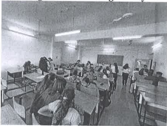
g. Team building activity