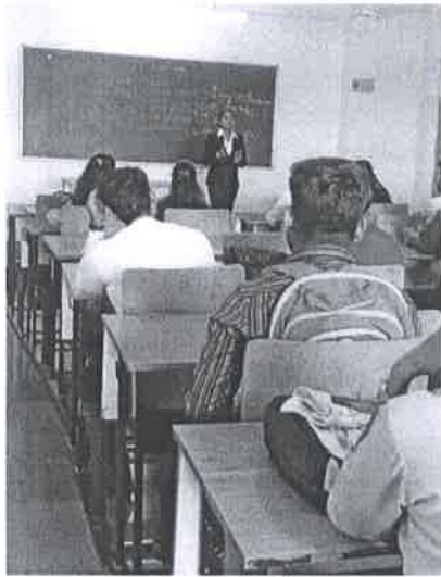
a. Interview tips activity