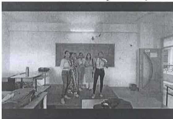
c. Team Building activity