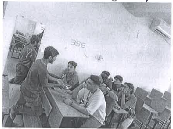
h. Team building activity