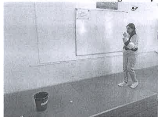
d. Confidence building activity