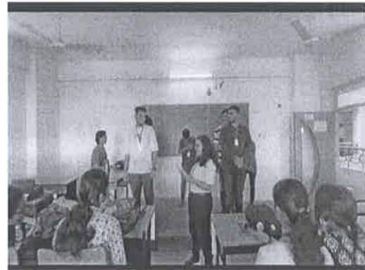
b. Confidence building activity