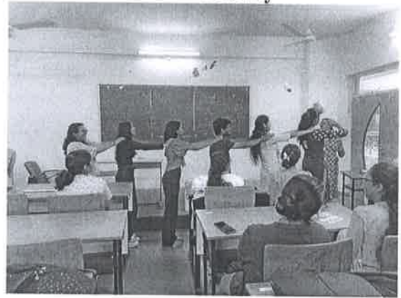
f. Communication skill development activity