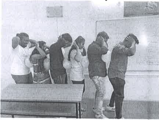
e. Communication skill development activity