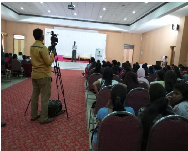
A state-of- the- art auditorium